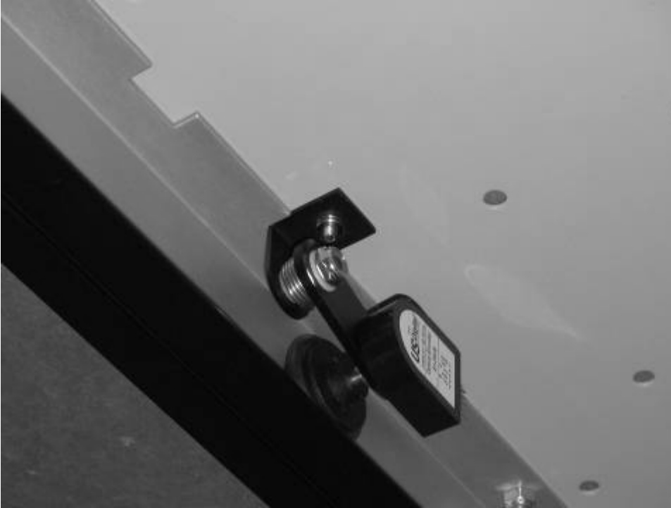
View from underneath the Carriage Platform .

Put both the encoder wires through the oval hole in the Carriage Platform . The longer one will plug into the x-axis encoder at the rear of the carriage. Be sure to allow plenty of slack, as the carriage moves from front to rear. Plug the shorter wire into the encoder under the carriage.